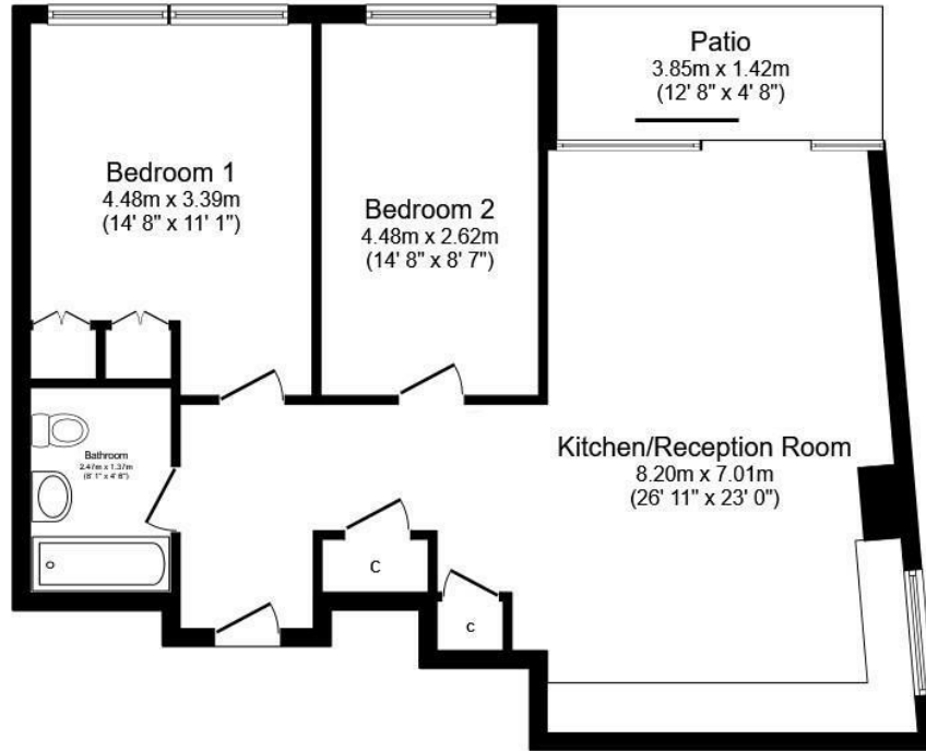
Floor Plan Floor area 73.1 sq.m. (787 sq.ft.)

Total floor area: 73.1 sq.m. (787 sq.ft.)